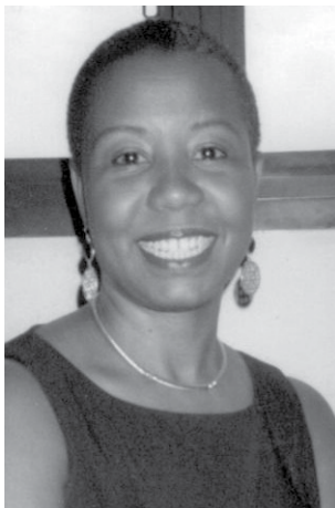
Voices of Boston

Looking at the participants of "The 2011 Summit on Early Childhood: Investment in our Future," the resounding answer is pediatricians and other health professionals, early educators, elected officials and children's advocates. On Nov. 16, these individuals gathered to learn about the "current state of early childhood developmental and behavioral health as well as the current state of current early childhood services." Sponsors included the Massachusetts Chapter of the American Academy of Pediatrics, Early Education for All, Massachusetts Society for the Prevention of Cruelty to Children and the Boston Children's Museum. The summit featured renown speakers, facilitators and attendees - including pediatrician and Harvard University professor Dr. T. Berry Brazelton, whose achievements in neonatal research have won worldwide acclaim and is now a standard practice for evaluating newborns.